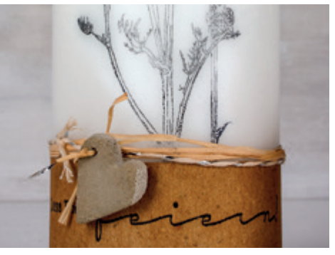
Incidentally: the stamp print adheres well to the candles, therefore no varnishing is here necessary.