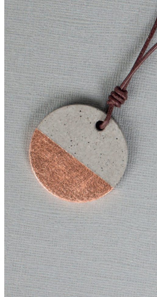
← Item 14769862