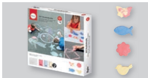
↑ 34466 000 DIY Kit Sidewalk chalk