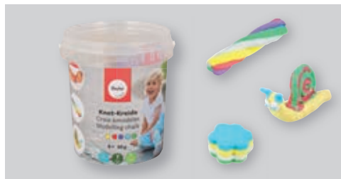
↑ 34462 000 Modelling chalk 6x125g