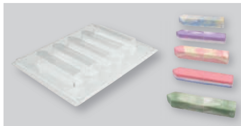
↑ 36111 000 Casting mould: Sidewalk chalk