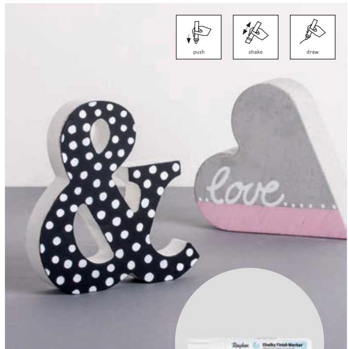
↑ Art. 35 017 ...