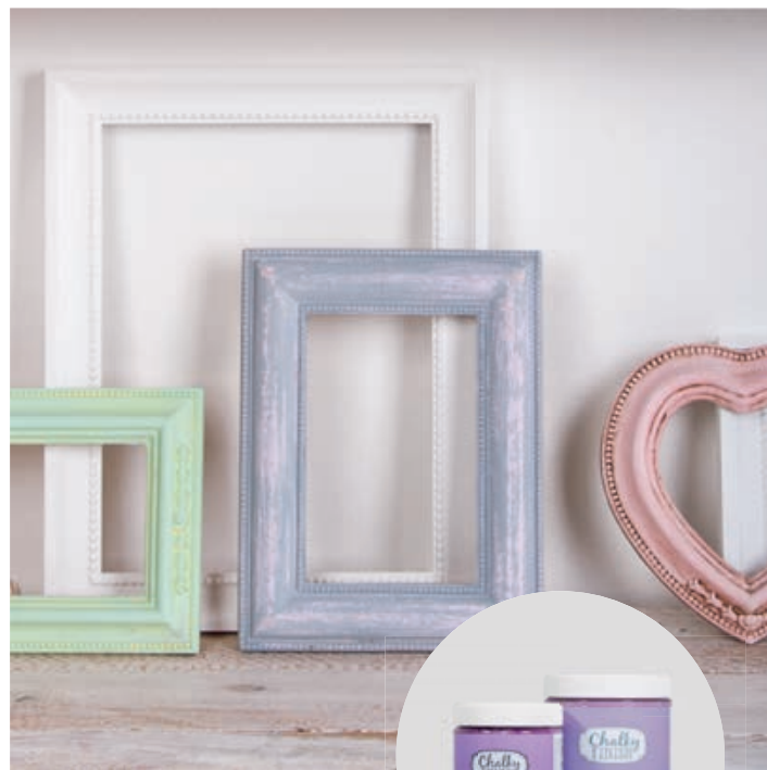
↑ Art. 38 867 ... + 38 868 ...