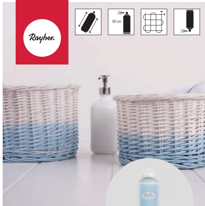
↑ Art. 34 371 ...