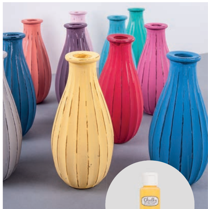
↑ Art. 38 866 ...